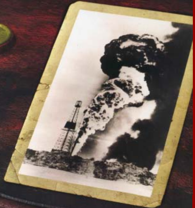
A column of smoke and flame erupts from Imperial Oil's Leduc #1, February 13, 1947.