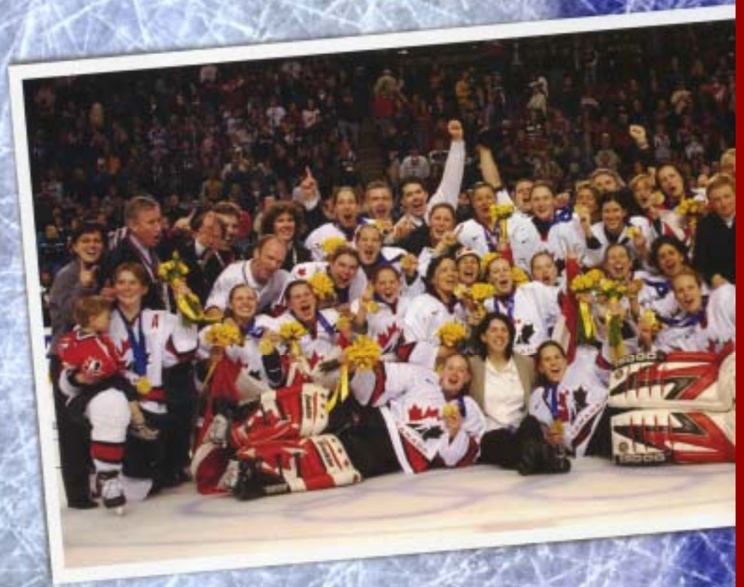
Canada's women's hockey team wins Olympic gold, 2002.